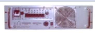
Energy Technologies N5 Series Power Distribution Unit/UPS