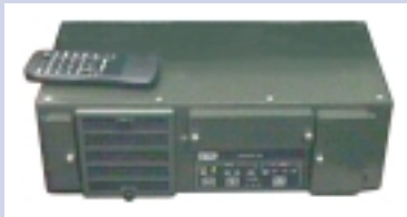
Rugged NT Workstation

Rugged HP Next Generation Unix Processor