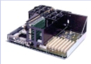
SPARC Ultra Axxp

Rugged HP Next Generation Unix Processor