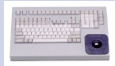
Fixed Bullnose (mounted on extrusions to save rail space)